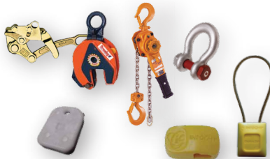
MultiMount, DuraBand Micro or DuraZip