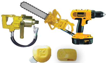
DuraDisc or DuraBand Micro