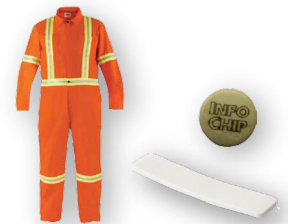
Sew-In Button or Slimflex