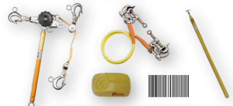
DuraBand Micro or Barcode