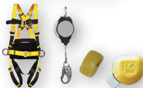
DuraBand Micro or DuraDisc