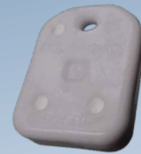
MultiMount Long Range RFID