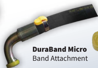
DuraBand Micro Band Attachment